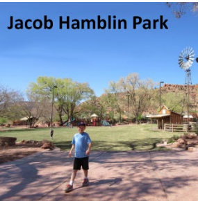
Jacob Hamblin Park